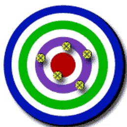
High accuracy, but Low precision!