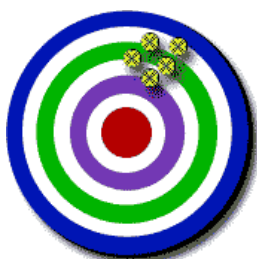
Low accuracy, but High precision!

To illustrate the differences between these two concepts, observe the dartboard examples below: