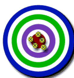
High accuracy & High precision!

In words, if your measurements are inaccurate , it means that they are not close to what the actual value is. For example, a piece of wood that is actually 1.3 meters long is measured as being 1.74 meters long. If your measurements are imprecise , it means that when you perform the same measurement multiple times, you get different answers. For example, if three people measured the length of the same piece of wood and got 1.74 m, 1.25 m, and 1.13 m. In science, it is important to use laboratory practices that ensure both accuracy & precision, and to be able to identify when your data are inaccurate and/or imprecise. Accuracy means your measurements are close to the real value, and precision is showing that your measurements are consistent.